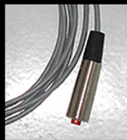
Hand-Trigger Switch (for manual operation) $49