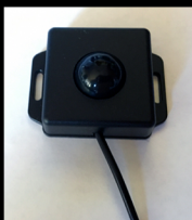
PIR Sensor (2" x 2") $49