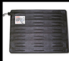
Pro Quality Switch Mat (18 x 24") $59