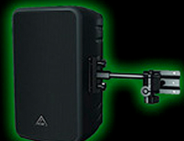
80 Watt Wall-Mount Speaker $199